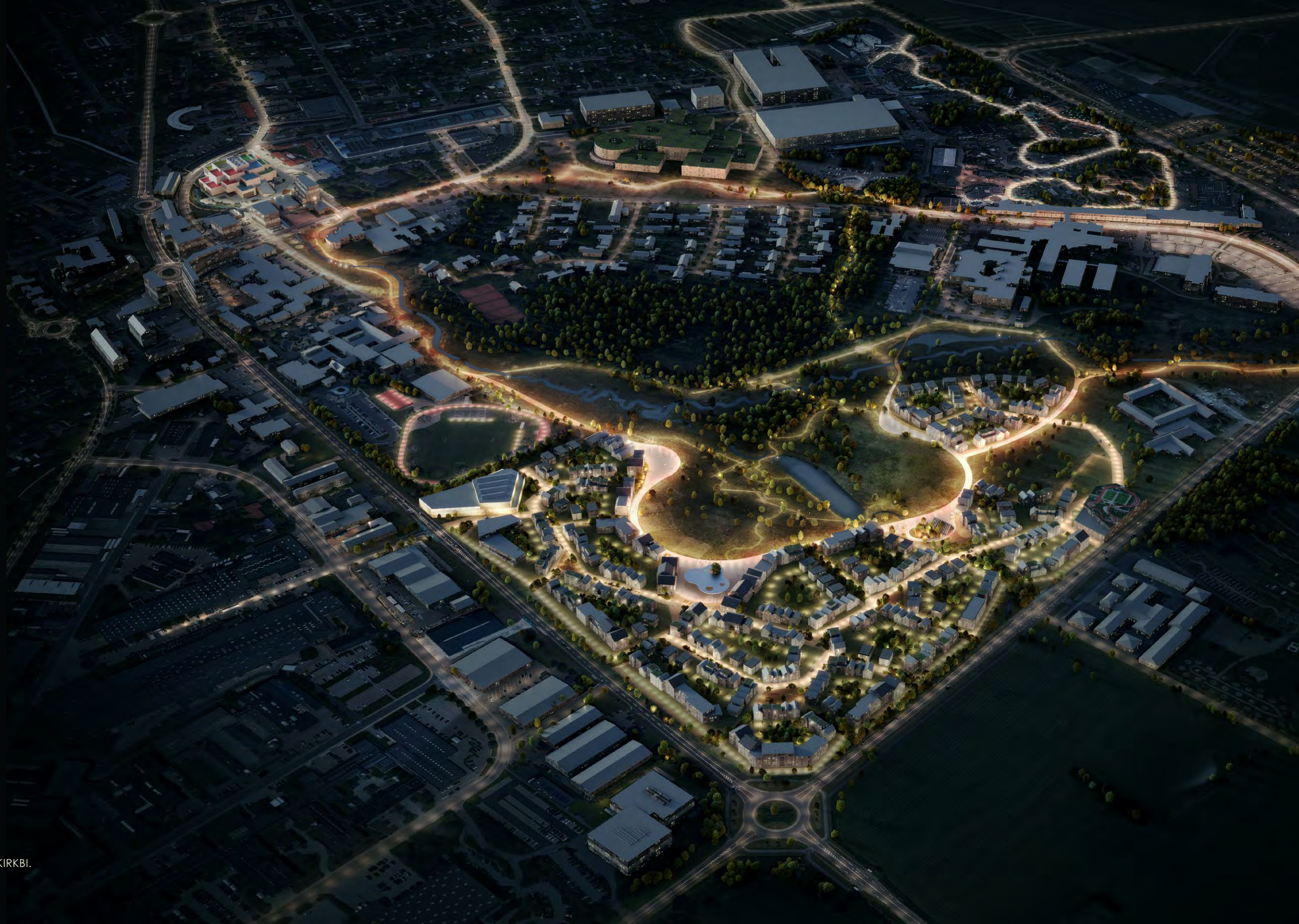
March 2022